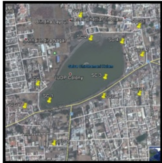
Fig. 2.1 — Ukkadam Periyakulam: Water sampling nodes

The flow chart best exemplifies the scrupulous methodology followed as regards the water quality indexing (Fig. 3.1).